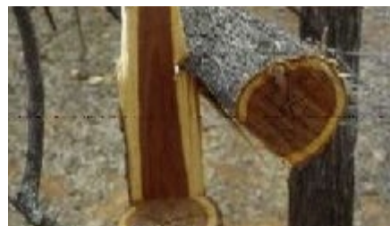
Acacia aneura wood has very high density in southwestern Queensland. (Shelton H.M.)