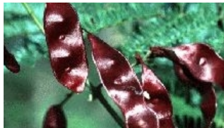
Seed pods: Unripe, flat, glossy maroon pods. Pods turn mid-orange when ripe. (Colin Hughes)