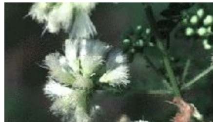
Flowers: Lax flower heads, illustrating cream-white stamen filaments. (Colin Hughes)