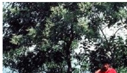
Tree habit: Typical small branchy tree in full bloom, Chiquimula, Guatemala. (Colin Hughes)

The species flowers throughout the year in its natural range, and at the end of the dry season in trials in Zimbabwe. A. angustissima is a prolific seed producer.