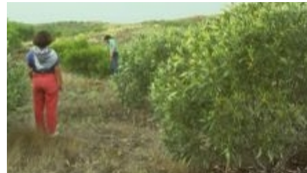
A. holosericea , line plantings on Fogo, Cape Verde Islands. (David Boshier)