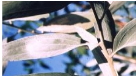
Acacia holosericea phyllodes