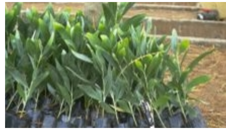
A. holosericea , seedlings in nursery. (David Boshier)

Like most acacias, A. holosericea relies on sexual reproduction. It produces a large number of flowers, a small proportion of which develops into fruit. It is pollinated by the activity of insects and birds. Seed dispersal is prompted by propulsion from drying dehiscent pods. Browsing vertebrates sometimes also play a role in seed dispersal. In its native range in Australia, The main flowering period is June-August but can be April-October. Fruits mature in August-October.