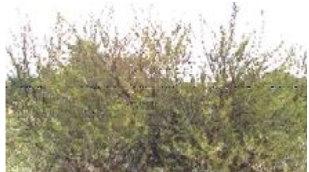
Grey, relatively smooth bark of this ecotype of sweet thorn. Differs from typical dark, rough, longitudinally fissured bark. (Ellis RP)