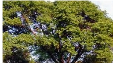
Typical habit of dwarf coastal form found on heavy clay soils (Ellis RP)

The species has a mixed mating system. It exhibits a tendency towards out-crossing, as evidenced by the existence of trees that are entirely male. It is zoomophilous, principally insect pollinated because the strong colour of inflorescence and the heavy pollen grains attract insects. Isolated plants bear no fruits. Pollinators include the Coleoptera, Diptera, Hymenoptera and Lepidoptera. Pods are dehiscent on the trees but not explosive; hence dispersal is principally by cattle and other herbivores ingesting seed and voiding them through their dung.