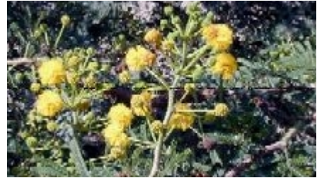
Deep golden yellow pom-pom like flowers borne in long, loosely packed terminal panicle-like sprays. Synchronised flowering occurs at regular intervals throughout spring and summer. Strongly scented and provides excellent bee food. (Ellis RP)