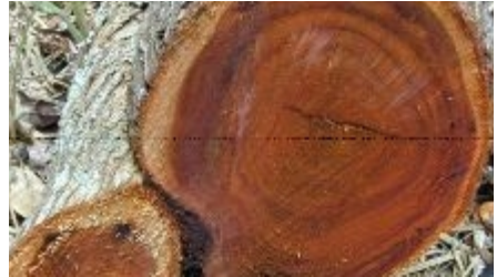
Wood at Makawao forest reserve, Maui, Hawaii