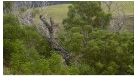
Exclosure at Pohakuokala Gulch, Maui, Hawaii