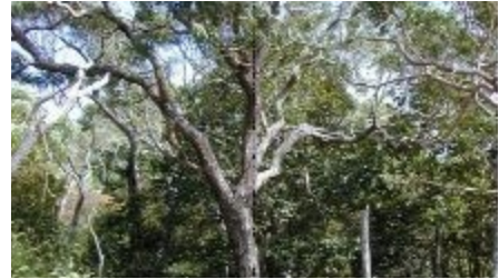
Habit at Makawao forest reserve, Maui, Hawaii