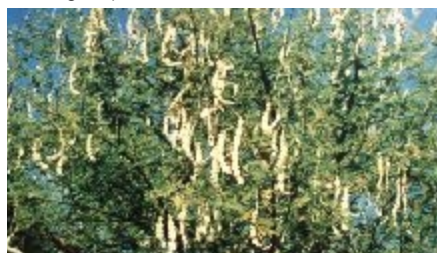
A. nilotica var cupressiformis , valued for its fastigate branching and narrow columnar crown suggesting unusual agroforestry potential, here in trials at the Central Arid Zone Research Institute, Rajasthan, India.