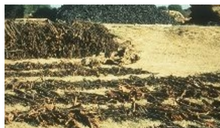
A. nilotica is one of the most widely planted and used trees in northern India for tannin from bark (foreground), firewood (middle) and charcoal (background), as here in the Punjab. (Colin E. Hughes)

The yellow sweetly scented flowers are nectarless and found in round heads. Most flowers are functionally male with a few hermaphrodites and are mainly bee-pollinated. Leaf production and fall are affected by rainfall whereas temperature affect flowering and fruiting. In Sudan A. nilotica flowers irregularly but generally between June and September and seed fall takes place from March to May. In Australia trees flower from March to June and green pods are produced within four months but ripe pods fall from November to February. Most of the leaf fall occurs during the dry period when the tree bears green pods.