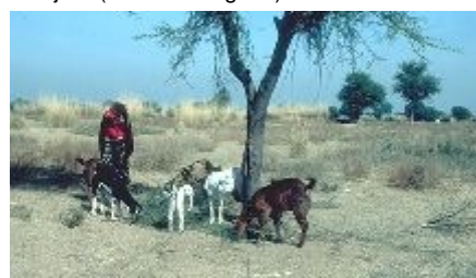
Typical tree of A. nilotica , being lopped for livestock fodder in Rajasthan, India. (Colin E. Hughes)