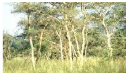
Acacia seyal (Lovett)