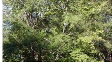
Trees