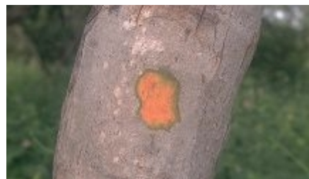
Andira inermis slash (Joris de Wolf, Patrick Van Damme, Diego Van Meersschant)

This is a deciduous tree which continually replaces its foliage throughout the year especially before flowering. In Puerto Rico, 2 flowering seasons are observed, between January and February and between May and September. In Panama, trees may flower for 9 months under suitable moist conditions, trees growing in urban areas in El Salvador flower between December and July. Bees, birds, and butterflies visit flowers that are self-incompatible and outcrossers. Bats eat the fruits and are the main seed dispersers.