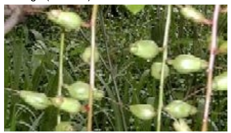
Petals 4, white tinged with deep pink with a mass of stamens, up to 35mm in diameter. Flowers open at night and fall the following morning. Flowers with unpleasant scent. (Ellis RP)