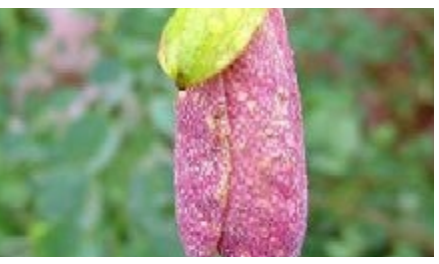
The flowers are pale yellow, but the petals are often pinkish in the bud. (Botha AD)

Trees flower in their 2nd year and are usually very floriferous, bearing flowers during most months of the year. In southern Africa, flowering can be observed from December to March; young fruits appear in January and mature in June or later.