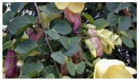
Bell-shaped flowers solitary, pendulous and large (7cm in diameter). (Ellis RP)