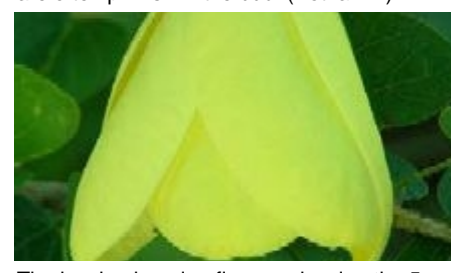
The lovely, drooping flowers showing the 5 yellow, subequal petals. (Botha AD)