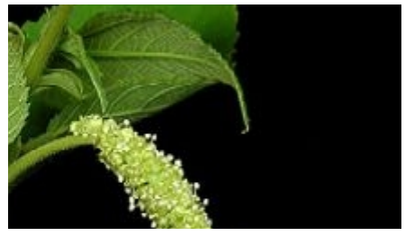
Male inflorescences

In India, leaves are shed between September and January and the new leaves appear in February or March. On average, B. papyrifera trees are leafless for 1-3 months. The flowers appear in March-April. The fruit ripens in the rainy season from July to September. Seed dispersed by birds.