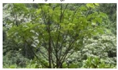
Habit at Keanae Arboretum Maui, Hawaii