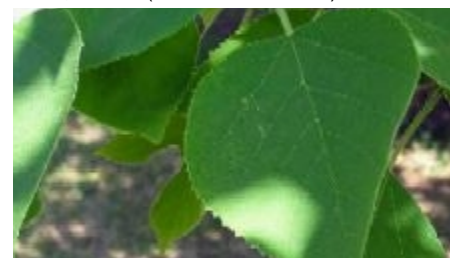
Foliage and fruits at Strybing Arboretum, Golden Gate Park, San Francisco, CA