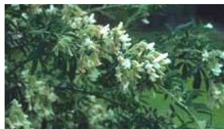
foliage (Western weeds)

In southern Australia, flowers appear in early spring (July-September) and pods ripen in November-December.