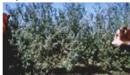
Cattle grazing Chamaecytisus palmensis in southwestern Western Australian (Shelton H.M.)