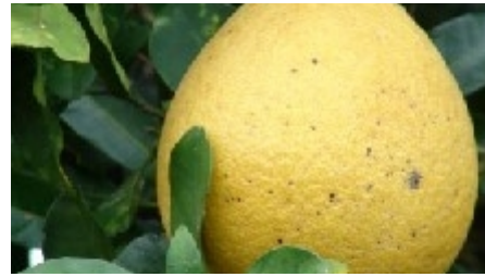
Fruit and leaves at Pulehu, Maui, Hawaii.

Pummelo is largely self-incompatible, and unlike other Citrus species, does not produce nucellar seedlings. Cross pollination and fertilization occur between pummelo and other species of the genus, giving it a greater range of genetic variability relative to other Citrus species. In most cases, the quality and quantity of production of pummelo is very low in farmers' fields due to inferior trees grown from seeds.