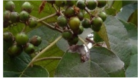
Fruits and leaves (Bart Wursten)