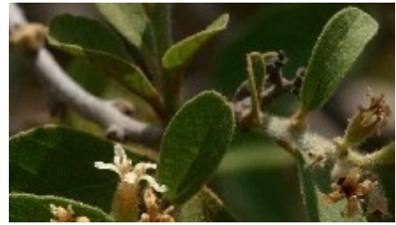
Flowers and leaves (Bart Wursten)

Flowering occurs in December to February and August while fruiting in April to June and December. Fruit are eaten by monkeys, baboons and birds which are the main dispersal agents.