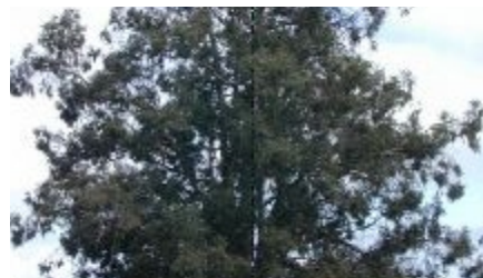
Habit at Kula, Maui, Hawaii