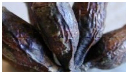
Cylindrical fruit flattened peduncles at Hobby collection Maui, Hawaii