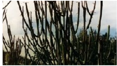
General habit: A large unarmed shrub or small tree up to 5 m tall. Branchlets are slender, smooth and cylindrical. Small leaves can be observed appearing on young green branches. The tree is at Muguga, 25 km northwest of Nairobi, Kenya. (Phanuel O. Oballa)

Plants usually produce male flowers. Female flowers or plants much less common. Plants with bisexual cyathia also occur, although the female flower apparently often aborts. E. tirucalli flowers in October and fruits from November-December and is pollinated by insects.