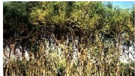
Windbreak: A windbreak of E. tirucalli in a farm at Kibos near Kisumu, Kenya. The row of trees is about 6 m high.