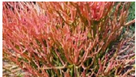
Trimmed live hedge: A trimmed dense live hedge of E. tirucalli near Kariandusi on the Nairobi - Nakuru road, Kenya. The acacia thorns on the hedge are added to further deter penetration by intruders. (Phanuel O. Oballa)