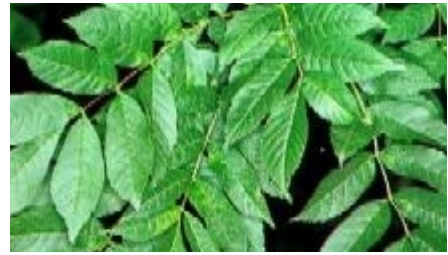
Compound leaves.