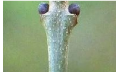
Detail of buds.