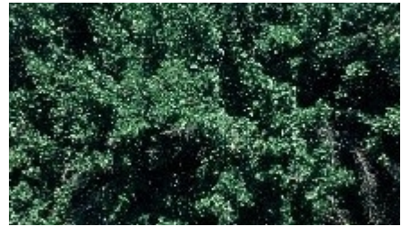
tree (Mark W. Skinner @ USDA-NRCS PLANTS Database)

Flowers in September at the Kenya coast and fruits in February-March. Elsewhere it flowers in June and fruit ripens in August.