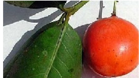
Fruit and leaves