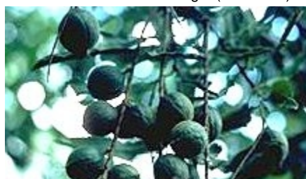
Fruits (French B.)