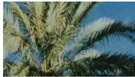
A tree affected by Fusarium oxysporum f.sp. albedinis showing wet feather symptoms