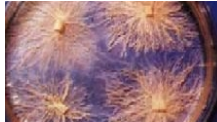
Fusarium oxysporum f.sp. albedinis cultures (FAO in collaboration with CABI)