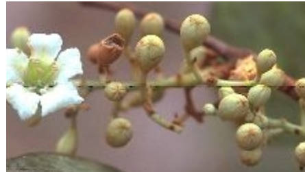
Piliostigma thonningii flowering shoot.