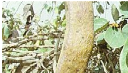
Piliostigma thonningii young pods