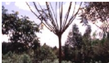
Polyscias fulva planted in a nursery in Kenya (James Were)