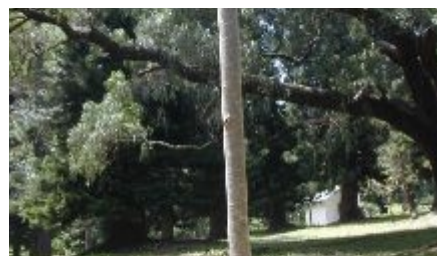
Polyscias fulva is branchless for a considerable height of the tree. This is a specimen at the Nairobi Arboretum, Kenya (AFT team)

In some ripening years, crops show a high percentage of hollow seeds, probably due to poor pollination. Flowers are bisexual.