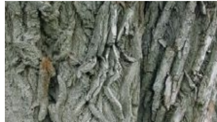
Bark