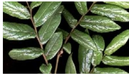
Dogwood leaves showing dark green and very shiny upper surface. Leaf stalks subtended by two, long, narrow stipules. Cultivated as a garden shrub. (Van Staden JM)

Flowering period in southern Africa is between October and December, and fruiting occurs from January to March. Flowers are popular with bees, which probably pollinate them. Fowls eat the fruit and most likely disperse the seeds.