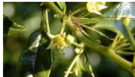
Small inconspicuous greenish flowers are borne on slender stalks in sparse, axillary groups or clusters of 2-10 flowers. Flowering occurs throughout the year and the flowers are sought after by bees. (Ellis RP)