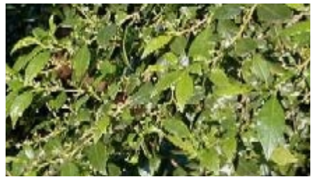
Very glossy dark green foliage on very dense, thick bushy tree, shrub or scrambler. (Ellis RP)