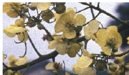
Leaves and flowers (G.A. Cooper @ USDA-NRCS PLANTS Database)

S. singueana is a hermaphroditic species flowering from around April to June. Its fruits are ready for collection around September.