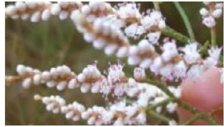
Flowers at LZ1 Kahoolawe, Hawaii

The leaves and branchlets are shed during the cold season, the new shoots and leaves appear about May. The species is monoecious and the small pinkish flowers appear from May to July, and capsules ripen in the cold season. In some parts of India, the seeds ripen in the middle of July to middle November. Ripe capsules turn brown, gradually open up and the seed is blown away.