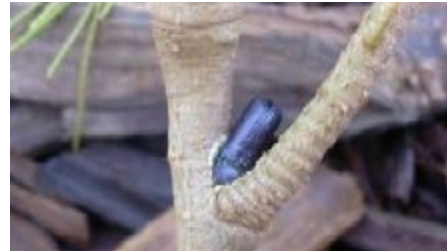
Plant at Kekaha, Kauai, Hawaii