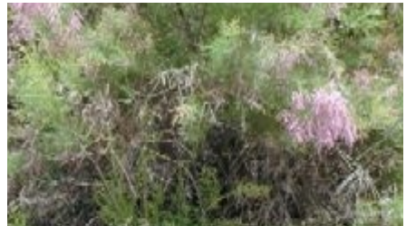
Flowers at LZ1 Kahoolawe, Hawaii