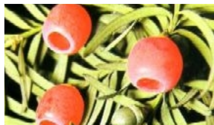
Leaves and fruits