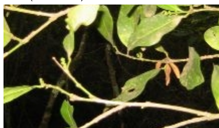
T. nobilis leaves