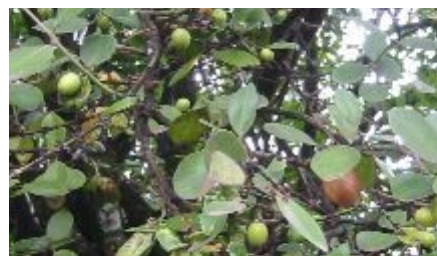
Fruit and foliage (Bob Bailis)

Dispersal of seeds in T. nobilis seems to rely little on frugivorous birds.