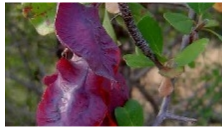
Leaves (Bart Wursten)

Trees flower from spring to summer in South Africa, while in Kenya, trees flower in years with normal climatic conditions from March to June. After pollination by insects, fruit development takes about 5-6 months. Brown-headed parrots eat the fruits, and probably disperse the seeds.