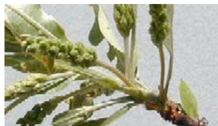
Young leaves with silver hairs, giving the tree a characteristic silver shine. Simple leaves, spirally arranged and clustered at the end of the branches. (Ellis RP)

It flowers in September and January and fruits in January to May, fruit remaining on the tree almost until the next flowering season. Pollination is usually by flies.