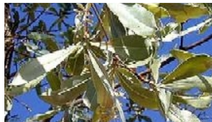
The leaves are clustered towards the tips of the branches; 55-120 x 15-45 mm large and densely covered with silky, silvery hairs. The branchlets are dark brown or purplish; peeling in rings and strips. (Botha R)