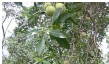
foliage and fruit

W. ugandensis is hermaphroditic, flowering at the beginning of the rainy season. Fruiting follows later in the rainy season; fruits may remain on the tree for a long time. In Kenya, the species flowers in December-January and seeds in May.