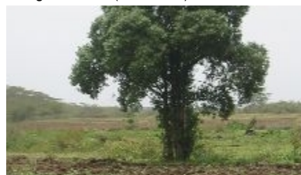
Tree on farm