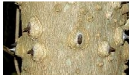
The trunk is smooth, grey with sharp spines on raised bosses. The spines are straight or slightly recurved. (Ellis RP)

Z. gillettii is monoecious. After pollination, the development of the subglobose fruits takes about 3 months. Flowering is very irregular, a phenomenon attributed to climatic conditions.