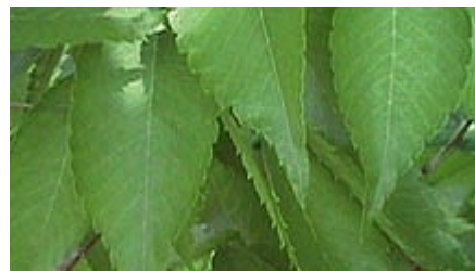
Leaves; taken at: Blake Garden - Kensington, CA and The National Arboretum - Washington, DC