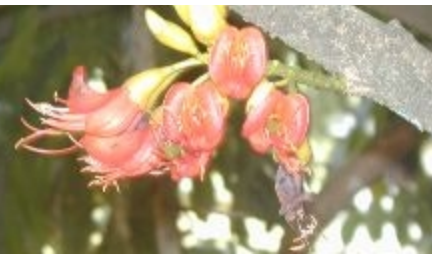
Castanospermum australe flowers on the stem.

The Australian chestnut is dioecious. Flowers between October and November, fruits mature from February-April.