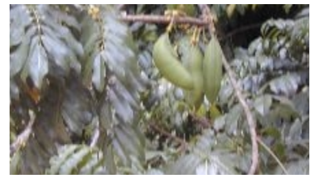
Castanospermum australe showing fruits at the Nairobi arboretum, Kenya. (AFT team)