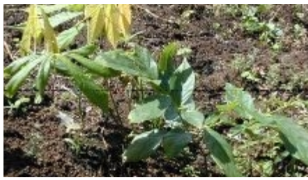
Regrowth at Haiku, Maui, Hawaii (Forest and Kim Starr)

D. elliptica may start flowering at 18 months of age. Wild plants flower and fruit normally. Pods ripen about 4 months after fertilization. In cultivation fruiting is rare.