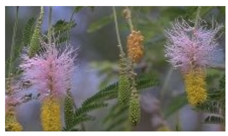
Dichrostachys cinerea flowering branch. (Joris de Wolf, Patrick Van Damme, Diego Van Meersschaut)

In Indonesia, D. cinerea has been found flowering from September to June and fruiting from March to May, sporadically in other months; in southern Africa flowering is from October to February and fruiting from May to September. The structure of the inflorescence suggests pollination by bats. The infructescence has a strong aroma, which probably attracts animals to feed on the pods. A fraction of seeds exhibit polyembryony with usually 2, sometimes 3, or rarely more embryos; the extent of polyembryony seems to be positively correlated with the number of seed produced.