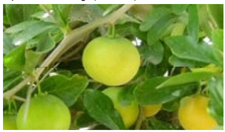
The fruits are round and fleshy, up to 40mm in diameter and orange-yellow when ripe. The fruit is edible and makes an excellent jam. (Ellis RP)