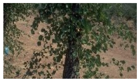
Typical "epicormic" branching habit of H. binata which permits limited lopping from the trunk for livestock fodder. (Colin E. Hughes)