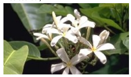
Holarrhena floribunda foliage and flowers.