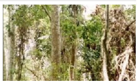
Khaya ivorensis: 36-year-old tree: Forestry Research Institute of Ghana trial plots at Benso in the wet evergreen forest ecological zone on Ghana. (Dominic Blay Jr.)

K. ivorensis produces a new crown of leaves usually between September and November, but the fresh leaves may begin to appear before the old ones fall. The flowering season is July to January, with most of the trees being in flower between September and December. The small white flowers are hermaphroditic. Fruits develop quickly and are conspicuous, as they stick up from the crown of the tree. They open and ripen from February to May. The seeds are wind distributed but do not travel far from the mother tree. The empty capsule may remain on the tree for several months