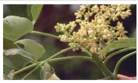
Khaya senegalensis flower

K. senegalensis is insect pollinated. Flowering shortly before or early in the rainy season, the fruit apparently remaining on the tree throughout the dry season. When the fruit ripens, the colour changes from grey to black. Begins to bear seed when the tree is 20-25 years old. Seed may be dispersed up to 100 m by prevailing winds.