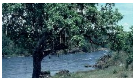
K. pinnata in Kabalega Falls National Park, Uganda.

Bats pollinate the bisexual flowers of K. africana. In South Africa, flowering occurs from August to October and fruiting from December to June.