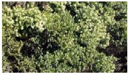
A shrub or small tree occurring in coastal bush and forest. (Ellis RP)