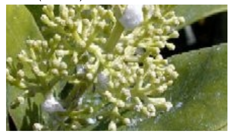
The inflorescences are compact, terminal heads. (Ellis RP)