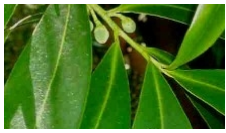
Flowers and leaves (MA Hyde)

Insects pollinate the bisexual flowers and birds disperse the fruit. In South Africa, flowering time is from April to May and fruiting from October to January.