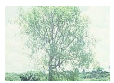
Zanthoxylum chalybeum (Patrick Maundu)

Male and female flowers are on different trees.